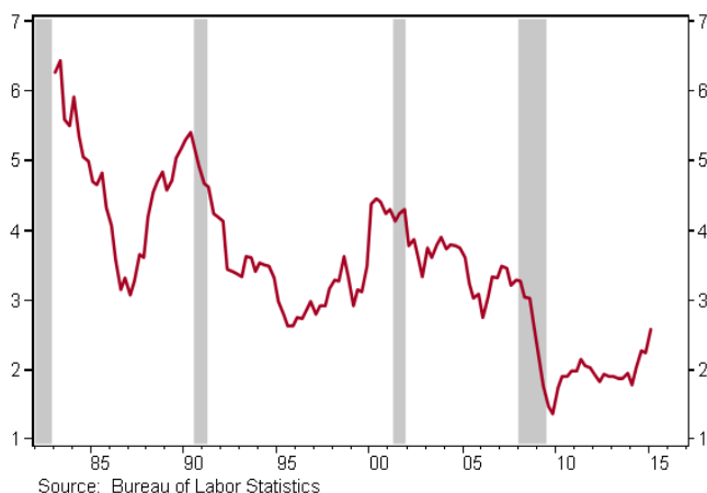
← Employment Cost Index: Compensation: Civilian Workers % Change - Year to Year SA, Dec-05=100

NFIB: Net Percent Planning to Raise Worker Compensation in Next 3 M... SA, % →